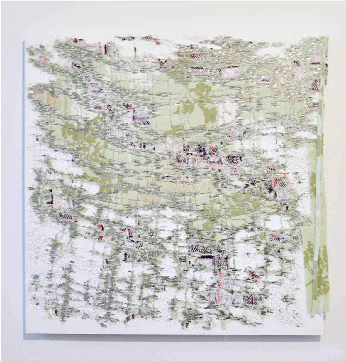
Untitled (Embedded Sampler) , 2020, Artist designed wallpaper, textile, metal staples in panel, 24 x 24 inches $5000