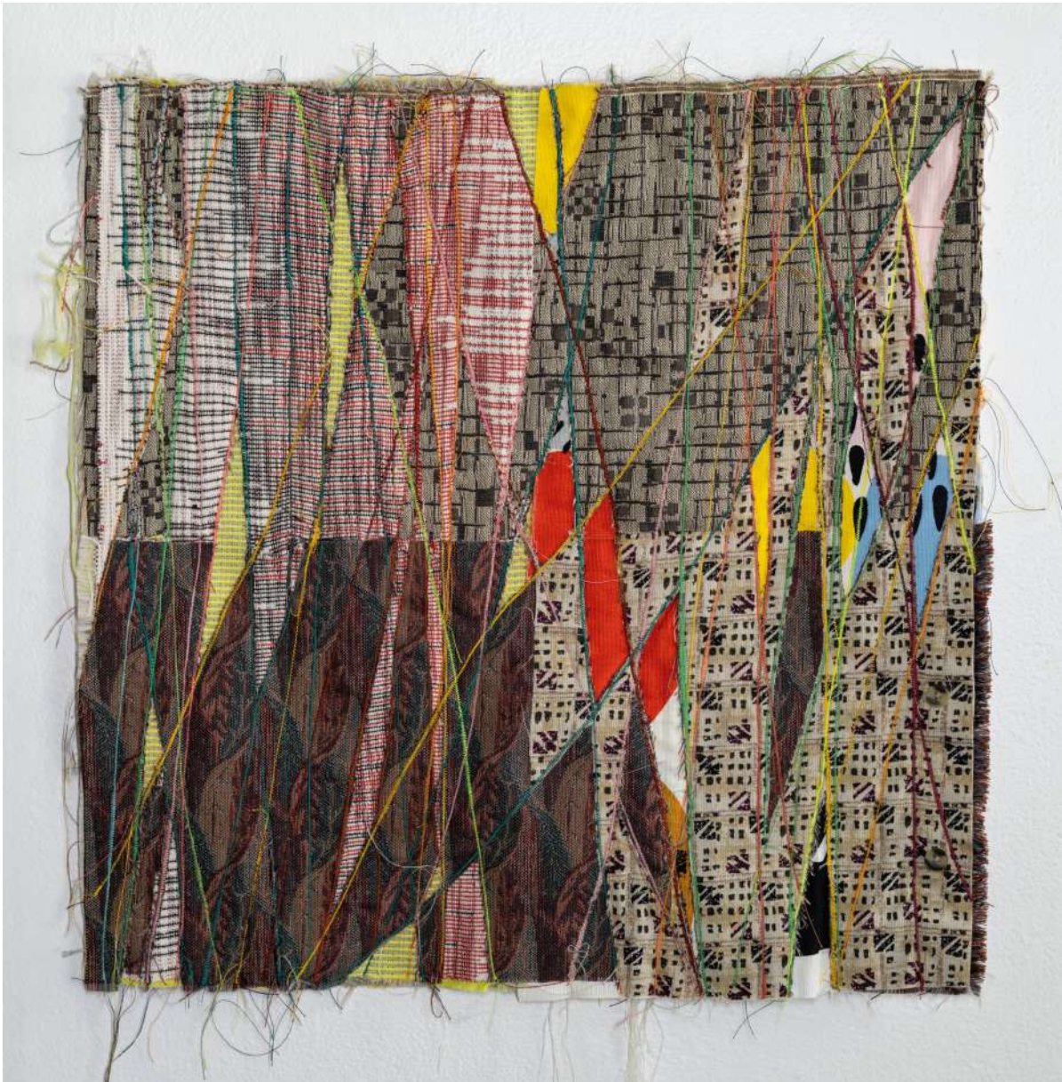
Sampling Today , 2020, Mixed textiles, thread 18 x 18 inches $3,000