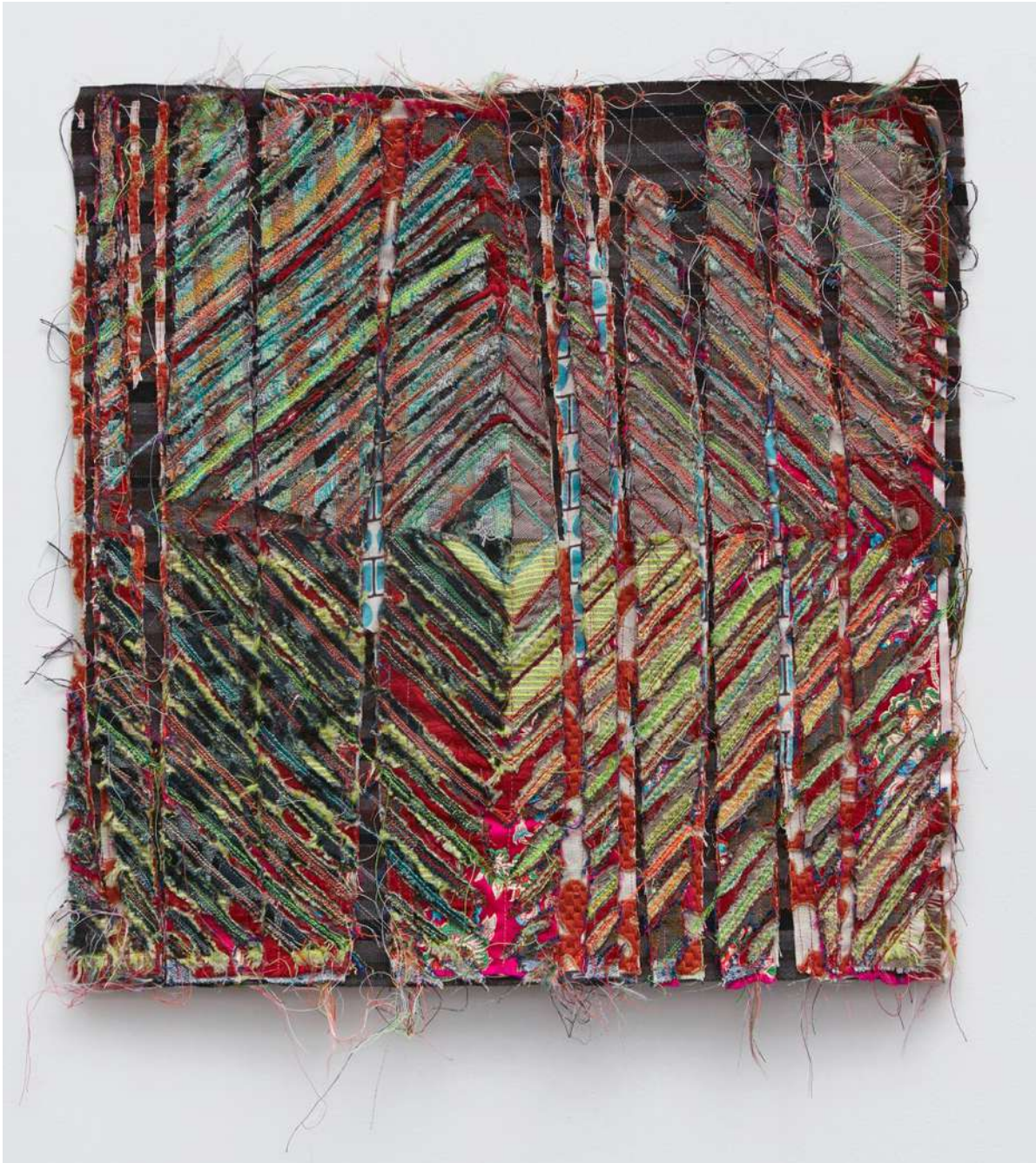
One Hard Won , 2020, Mixed Textiles, sewing thread, 19.5 x 19 inches $3,000