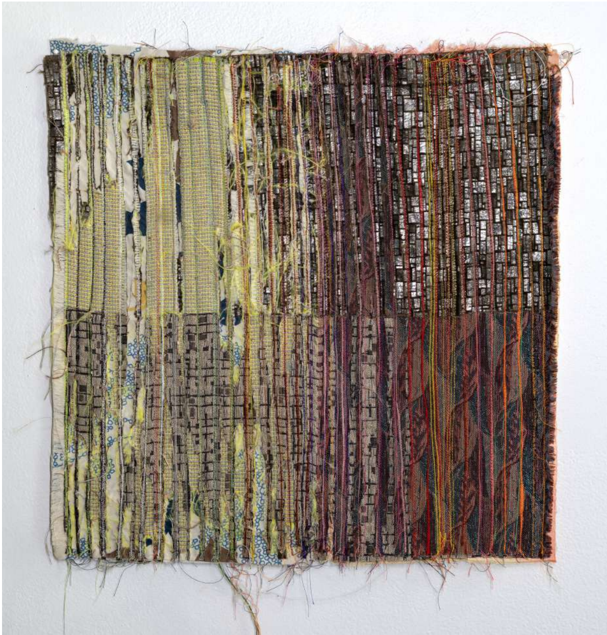
Monday, June 22, 2020 , Mixed textiles, thread, 19 x 19 inches $3,000