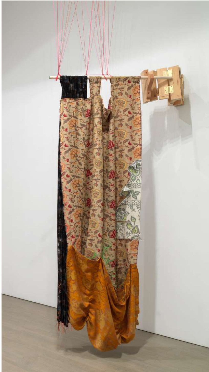
Cross Pollination #1 , 2020, lumber, mixed textiles sourced in Norway, Russia and New York, embroidery floss, hardware, nylon cord, dimensions variable $16,000