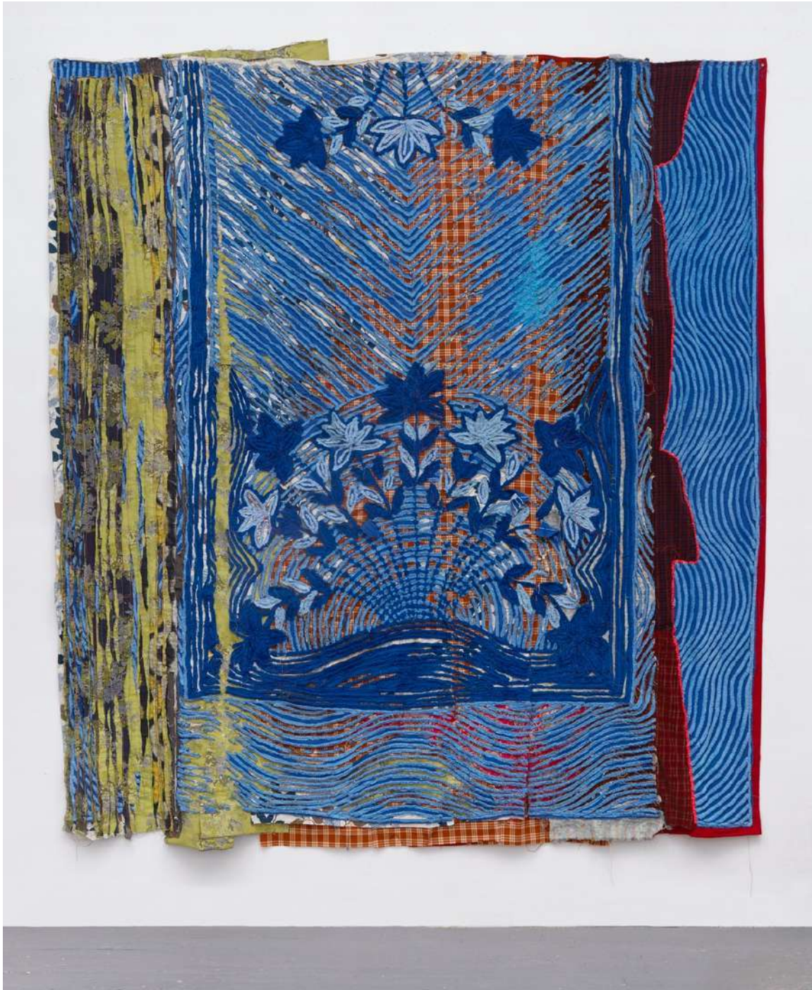
Not Yet Titled , 2021, Vintage chenille bedspread, mixed textiles, embroidery floss, sewing thread, 94 x 85 inches $17,500