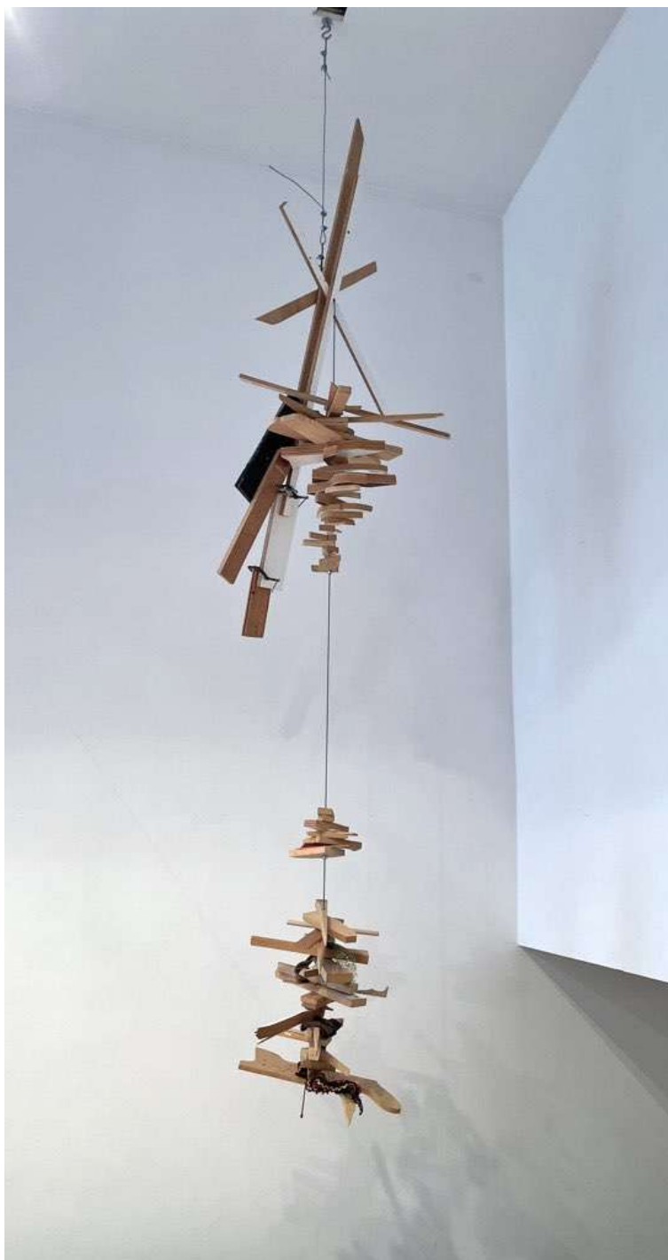
The Angel of History , 2013, Miscellaneous lumber, steel cable, hardware, dimensions variable $15,000