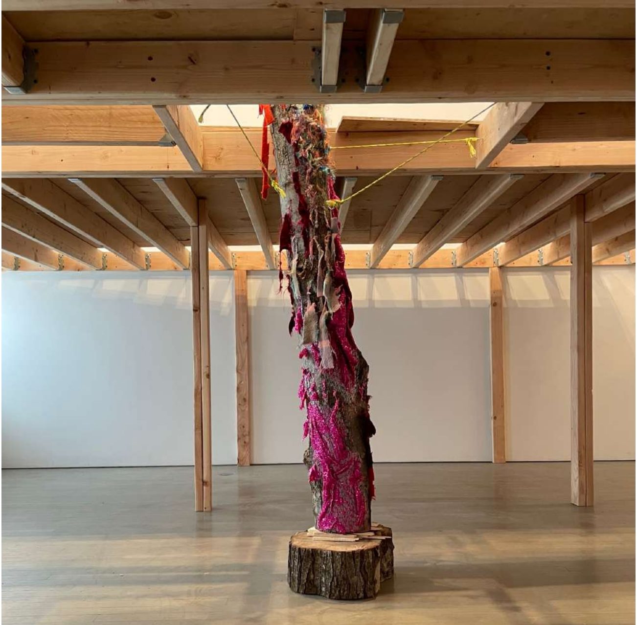
(detail) If a tree... , 2022, Cut logs, mixed textiles, metal staples, hardware, nylon cord, miscellaneous lumber, dimensions variable, $25,000