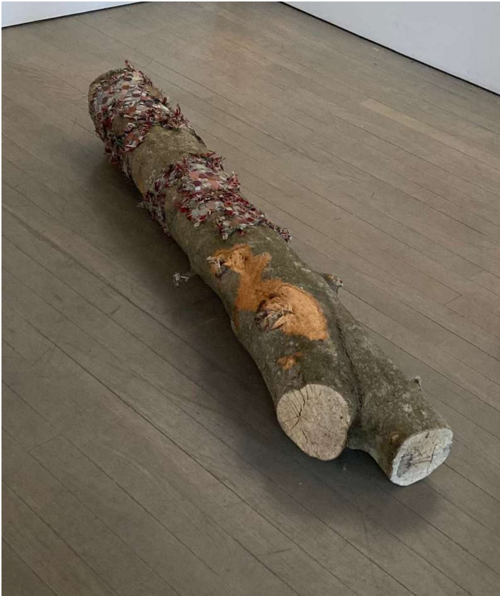
Untitled , 2022, Cut log, metal staples, textile, 46.5 x 6.5 x 8 inches $7500