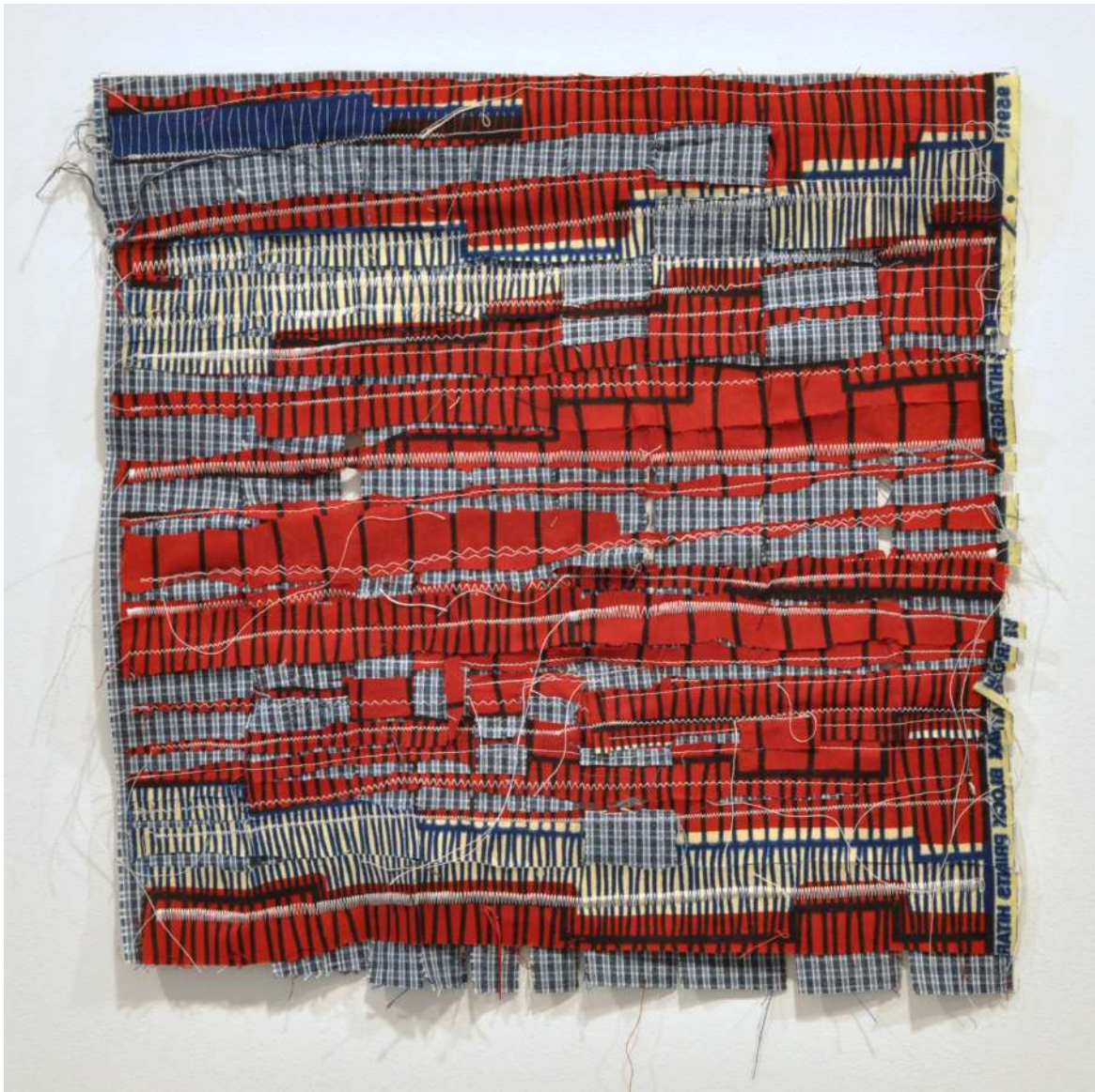
Friday Sampler , 2020, Mixed textiles, thread, 16 x 16 inches $2500